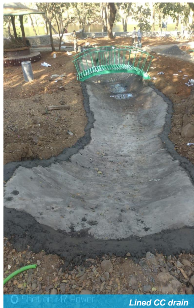
Lined CC drain